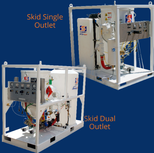
Skid Dual Outlet