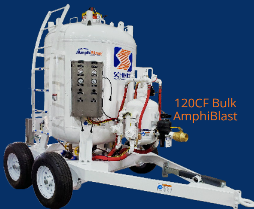
120CF Bulk AmphiBlast

*Blast pressure is one setting for all outlets